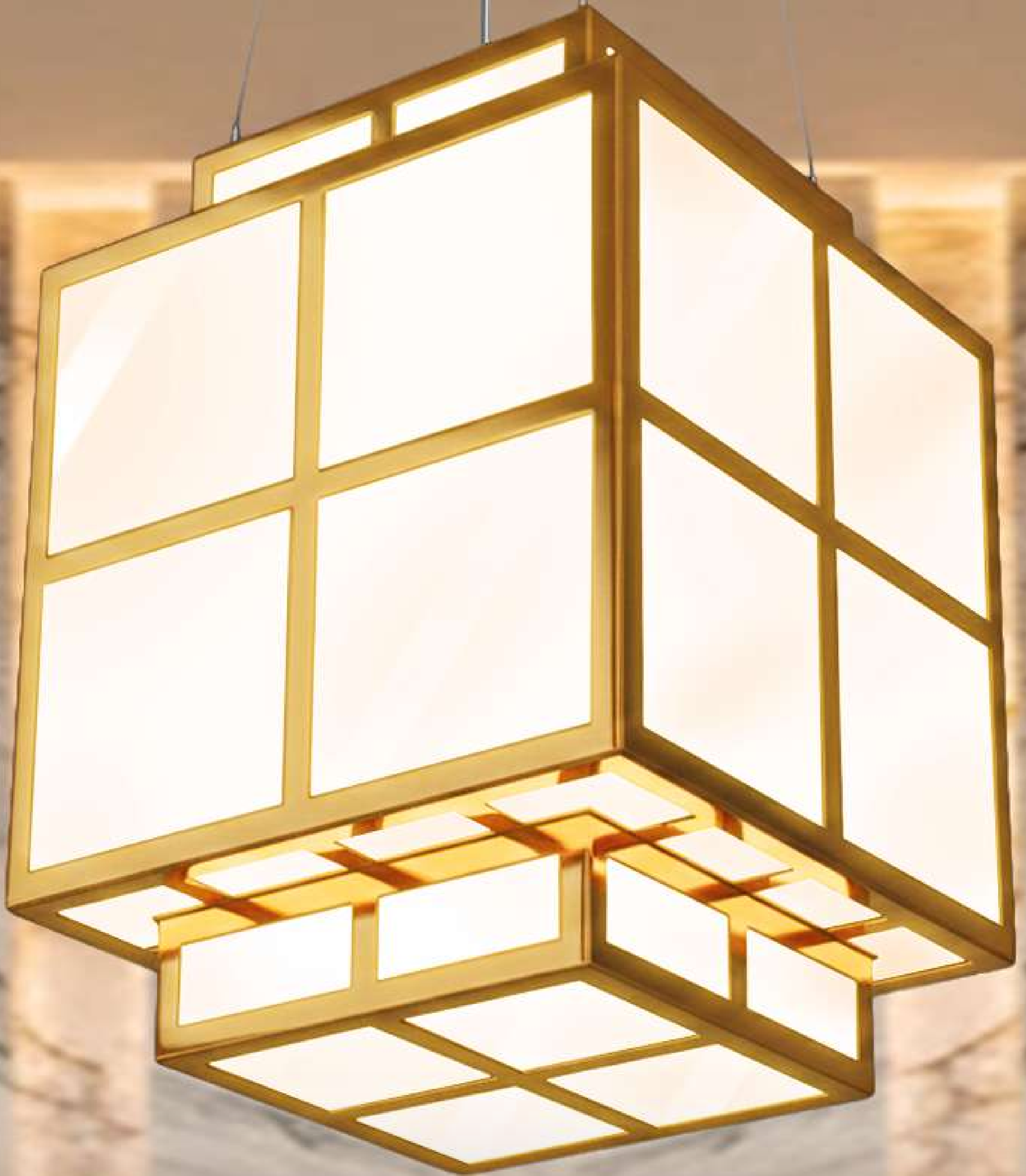
TURM 2 | Pendant