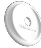
F04 GLOSS WHITE