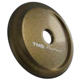
F33 PYRITE BRONZE