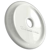
F05 GLOSS WHITE