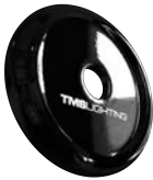
F16 GLOSS BLACK