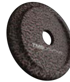
F26 MELTED COPPER