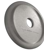
F31 SILVER METALLIC