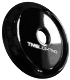
F16 GLOSS BLACK