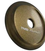
F33 PYRITE BRONZE