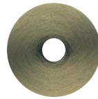
AB ANTIQUÉ BRASS