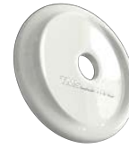
F05 GLOSS WHITE