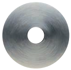
SN SATIN NICKEL