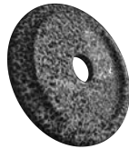
F24 MELTED PLATINUM