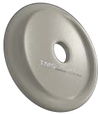
F18 SATIN ALUMINUM