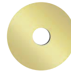
PB POLISHED BRASS