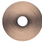
AC ANTIQUÉ COPPER