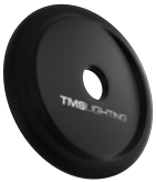
F15 MATTE BLACK