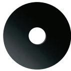
BC BLACK CHROME