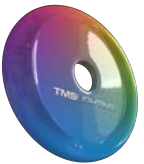
RAL CUSTOM COLOR (RAL #)

NOTE: DISPLAYED FINISHES DIFFER BETWEEN SCREENS AS WELL AS PRINTERS AND MAY NOT ACCURATELY DEPICT COLOR.