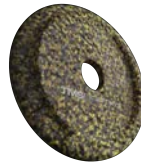
F25 MELTED GOLD