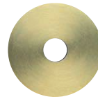
SB SATIN BRASS