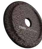
F26 MELTED COPPER