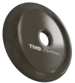
F32 METALLIC BRONZE