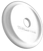
F04 MATTE WHITE