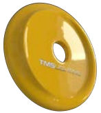
F14 SUNSHINE YELLOW