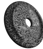
F24 MELTED PLATINUM