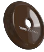
F07 ZEUS BROWN