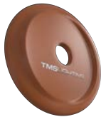
F45 COPPER METALLIC