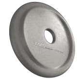
F31 SILVER METALLIC