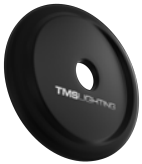
F15 MATTE BLACK