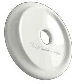
F05 GLOSS WHITE