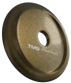
F33 PYRITE BRONZE