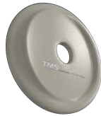
F18 SATIN ALUMINUM