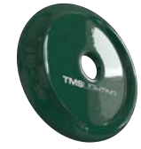
F13 FOREST GREEN