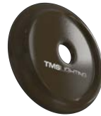
F21 ARCH BRONZE