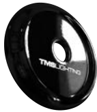
F16 GLOSS BLACK