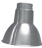
BR BRUSHED ALUMINUM