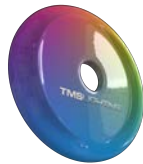
RAL CUSTOM COLOR (RAL #)

NOTE: DISPLAYED FINISHES DIFFER BETWEEN SCREENS AS WELL AS PRINTERS AND MAY NOT ACCURATELY DEPICT COLOR.