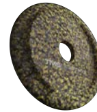
F25 MELTED GOLD