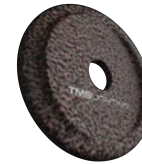
F26 MELTED COPPER