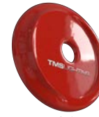
F10 FIRE RED