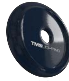
F08 MIDNIGHT BLUE